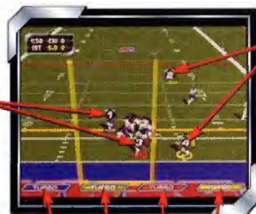
Players 1 & 3

PLAYER CONTROL: NFL Blitz 2000 allows you play with up to four players. If you are playing a four player game, the teams are split into two players per team. On Offense or Defense, two players can put their skills together to punish their opposition. On Offense, one of the players is the Quarterback, while the other player is set as a Receiver without any specific play pattern to follow. On Defense, you can have one player rush the QB or just hang back with the other player to ensure no progress is made by the Offense. Each player will have an icon above them with their player number to show their location on the field. Each player's TURBO METER is located on the bottom of the screen.